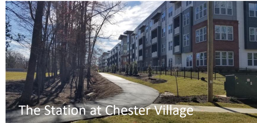
The Station at Chester Village

We have had 5 solid years of implementing the county's bikeway system. Most have been built by the development community. They have built sections nearly a mile long yet are not connected to places yet. This is where the county must come in and make the connections. Let people get to destinations and to other neighborhoods.